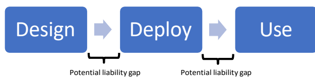
Fig. 1 Simplified model of the stages of the process of putting technologies on the market. Actors are typically related to one stage, potentially creating liability gaps between stages

airline tickets or shipping freight. In the context of military technologies, large defense contractors such as BAE Systems produce the systems, whereas states can be said to be the deployers. The users of the systems are the commanders and other personnel who field them for individual missions.